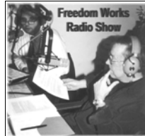
Libertarian Radio Show

In 2002 Libertarians in Pinellas, for the first time had a Full Slate of state house candidates thanks to ballot access achieved by Florida Libertarians in 1998 with Revision 11 .