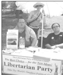
Distributing Libertarian literature at public events and forums

Pinellas Libertarians have been successful at public venues and setting up Libertarian Information tables. This is a great way to survey local citizens and find out their concerns.